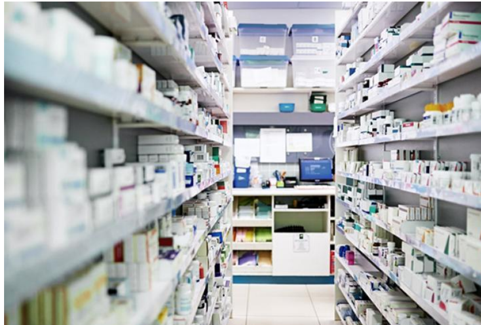
Image accessed: https://www.commonwealthfund.org/publications/issue-briefs/2019/mar/pharmacy-benefit-managers-practices-controversies-what-lies-ahead